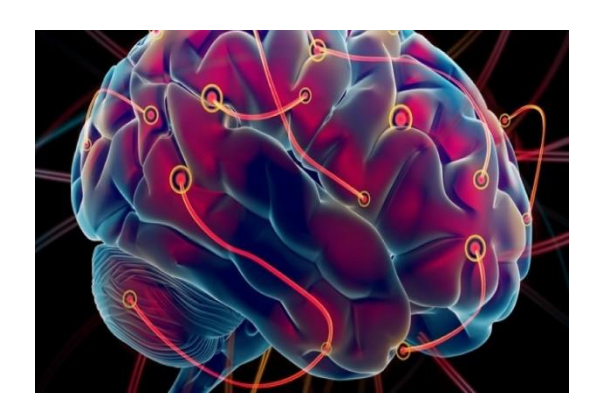
How does learning new skills change your brain? Can brain plasticity reveal more about the aging brain?