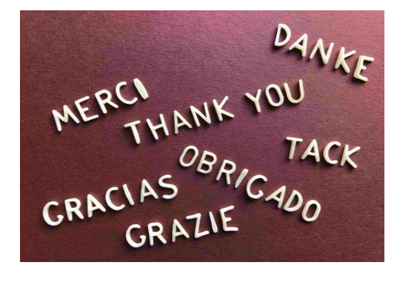
How does bilingualism affect the brain and mind? Find out more about how two or more languages co-habit within a single mind

Find out more about how humans and AI will work together in the future