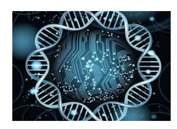
Computers and biology?

Why are computers needed to understand life? Is the "one gene one characteristic" true?