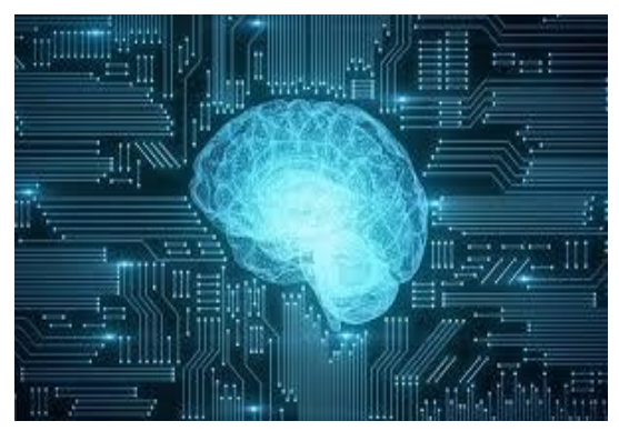
Yes, AI can do that but... should it?

Find out more about how humans and AI will work together in the future