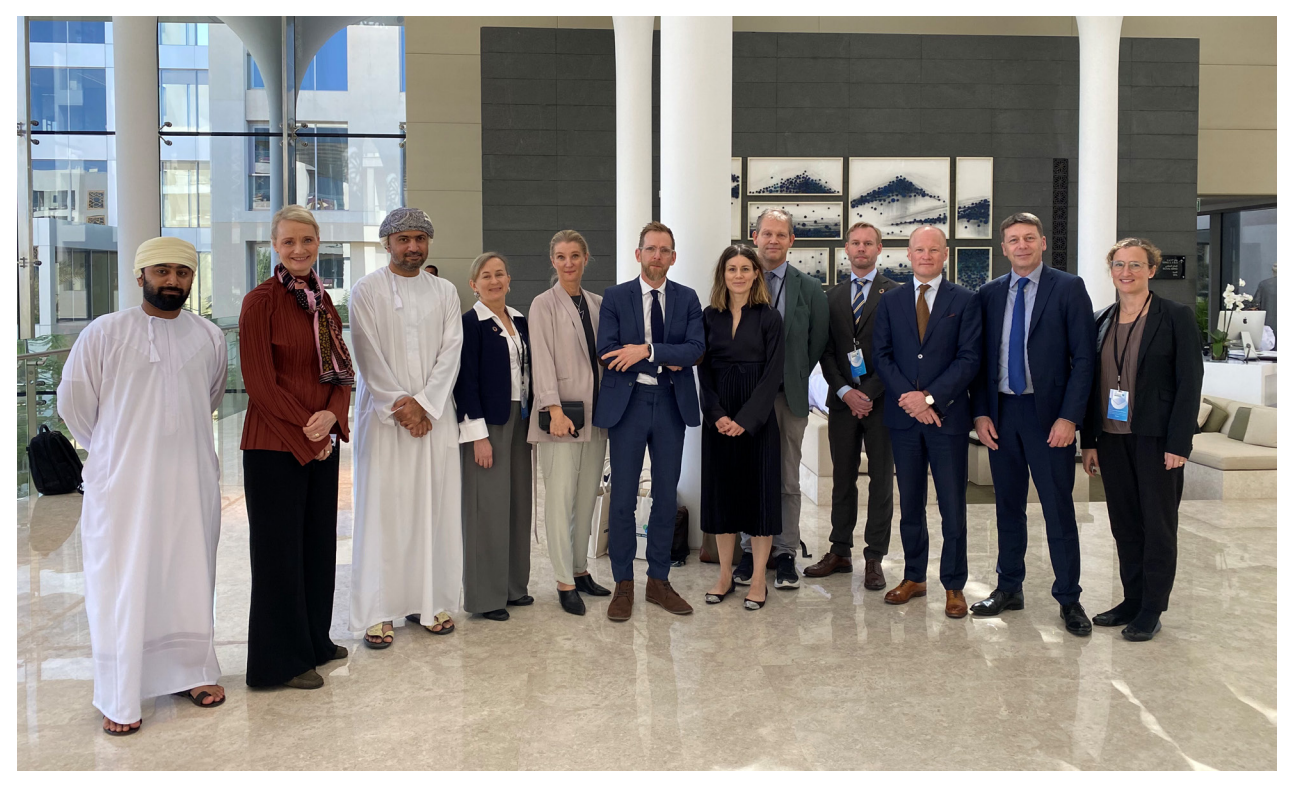
United Nations' "High Level Ministerial Meeting on Antimicrobial Resistance", Oman, November 2022, with invited representation from CARe. The objective of the meeting was to prepare an agenda for the United Nations Global Assembly meeting in September 2024. The meeting was attended by over 50 governments.