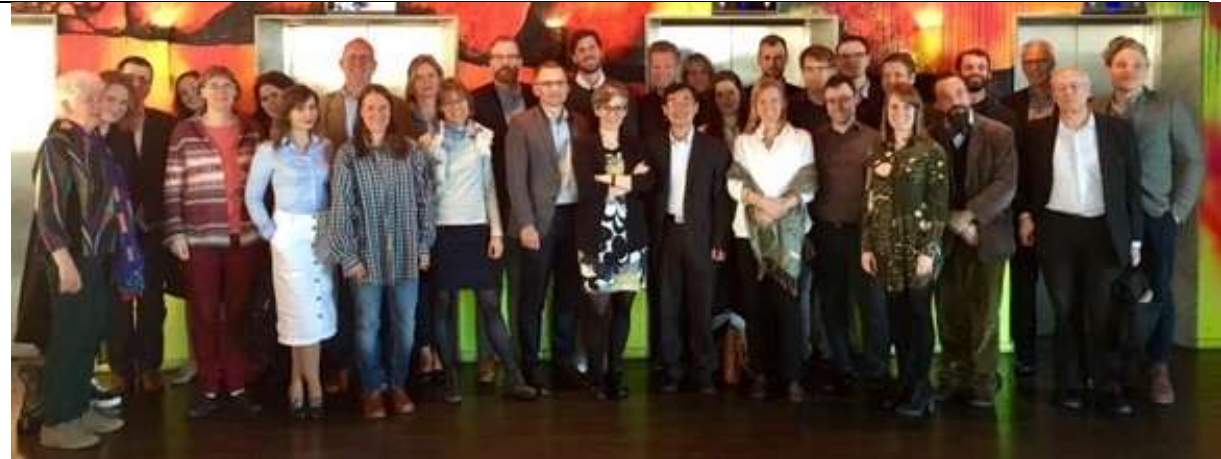
CERGU researchers at Gothia Towers, May 2017