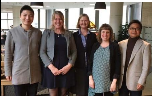
The CERGU team with two PhD students researching European issues