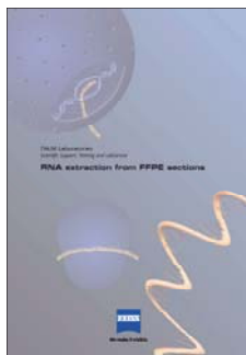
Short Protocol RNA extraction from FFPE sections