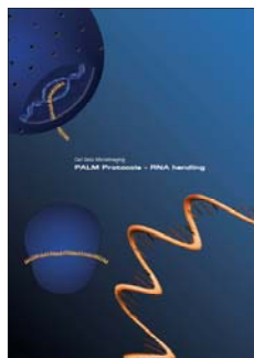
LCM Protocols RNA handling