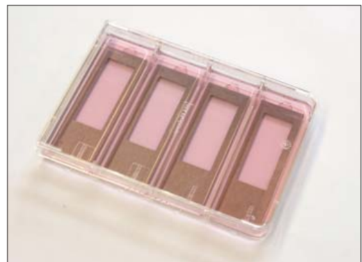
quadriPerm with FrameSlides

These are recommended if weak fluorescence signals have to be detected, e.g. due to low signal to noise ratio. FrameSlides are inserted into a quadriPerm cell culture plate (Greiner bio-one, # 96077307) with the membrane-side facing the bottom of the plate (Zeiss symbol visible). Cells are seeded into the cavity of the FrameSlide in the desired cell count and covered with approximately 0.5 to 1 ml medium of choice.