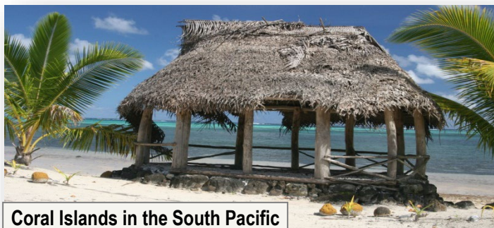
Coral Islands in the South Pacific