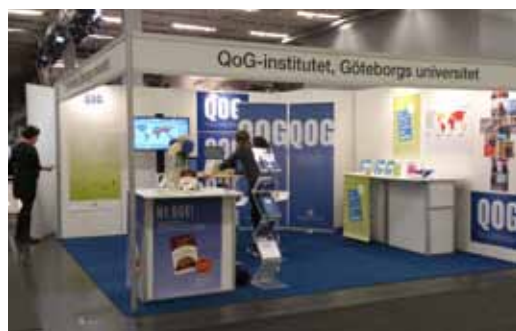
The QoG Institute's booth at the Gothenburg Book Fair

The biggest event in 2012 was the Practitioners conference in May which you can read more about on pages 8-9. Other